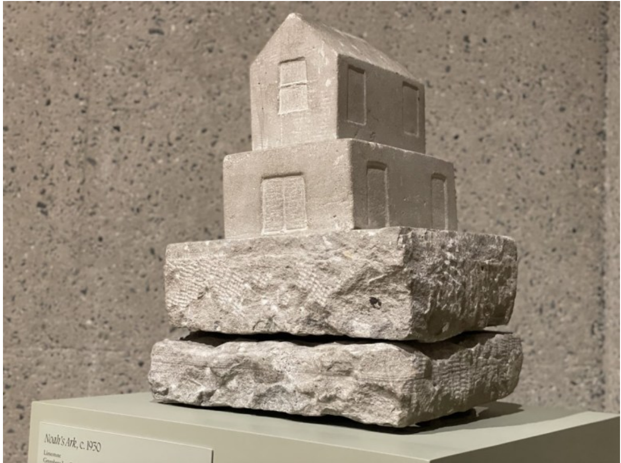
William Edmondson, "Noah's Ark" (c. 1930)