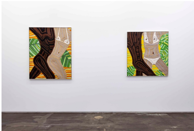
Installation view, Cheryl Pope, BASKING NEVER HURT NO ONE (2019).