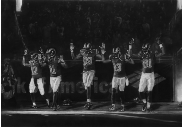
Robert Longo, "Full-scale Study for Five Rams (Ferguson: Hands Up: November 30, 2014)" (2015), charcoal on archival pigment print